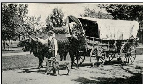
Ezra Meeker